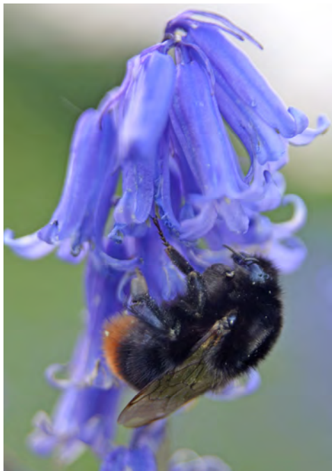
The common or English bluebell ( Hyacinthoides non-scripta )